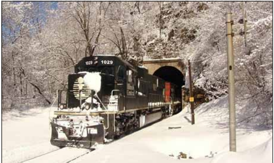
Above - This CN #1029, Extra Grain, was eastbound out of the East Debuque tunnel February 26, 2008.